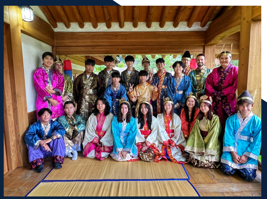
*Students wearing traditional royal gowns in Korea*