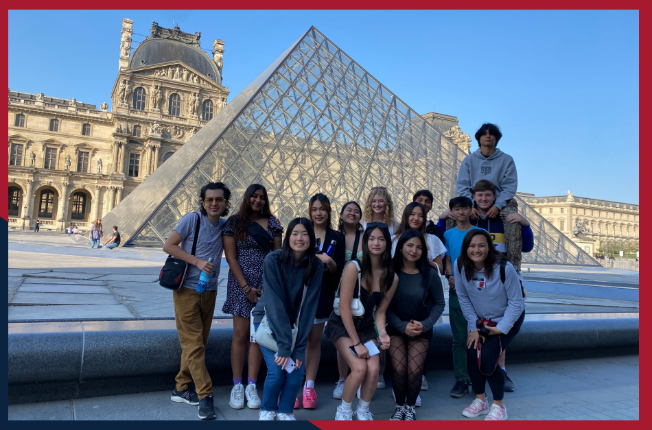
*Louvre Pyramid: Paris, France*